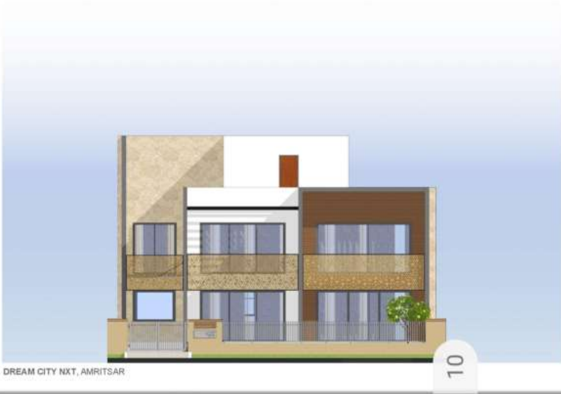
Type E2 600 sq yds