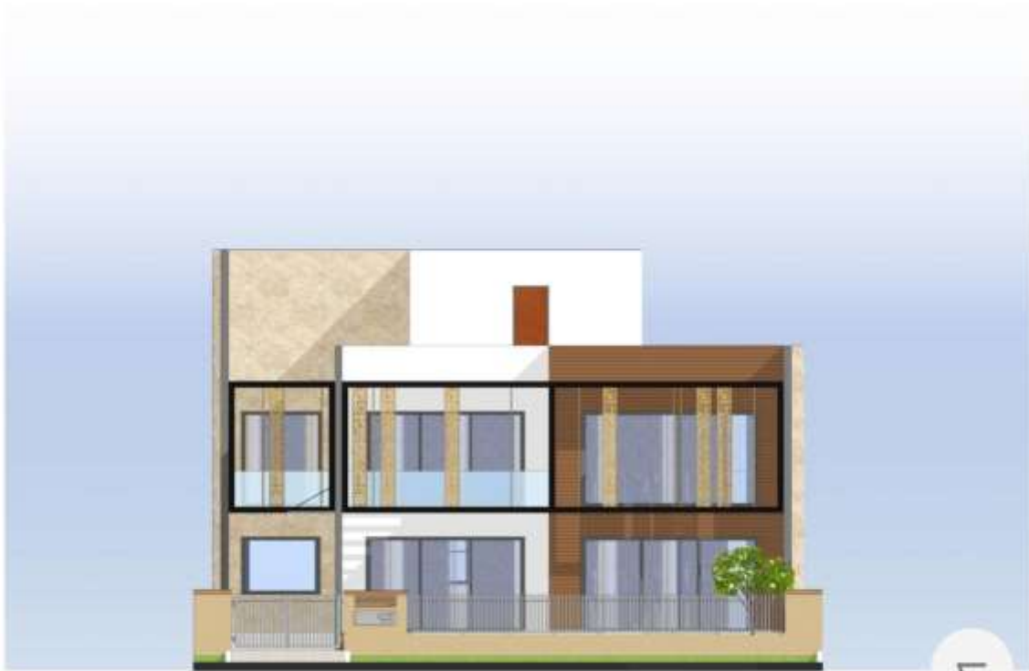
DREAM CITY NXT, AMRITSAR